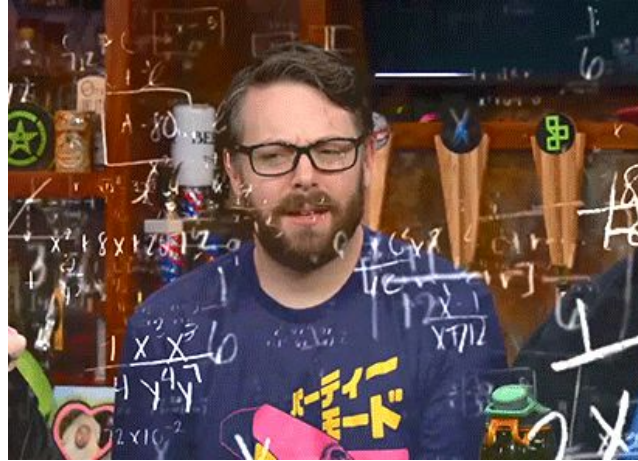
Thank you for the Dreambox!