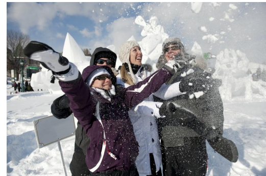
International Program 2019/20